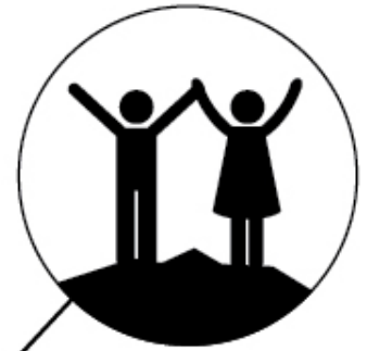
World Impact Stage